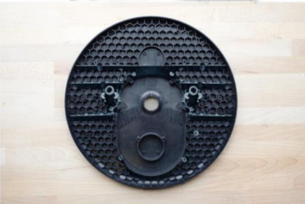
Sled Quantity 1. Properties: Glass fiber reinforced polycarbonate