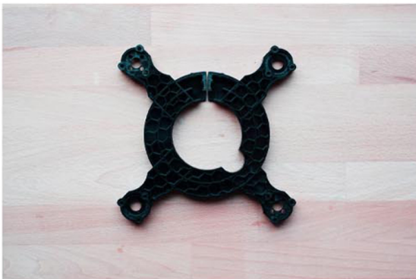
Router Clamp. Quantity 2. Properties: Glass fiber reinforced polycarbonate