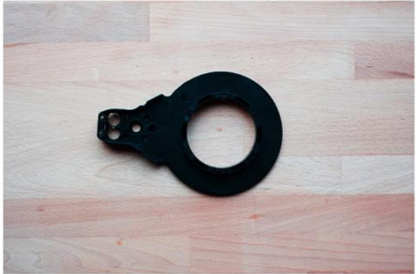
Arm Frame. Quantity 8. Properties: POM.