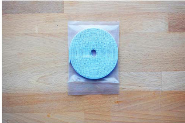
Belt. Quantity 4. Properties: Steel reinforced TPU, 14.5 feet long.