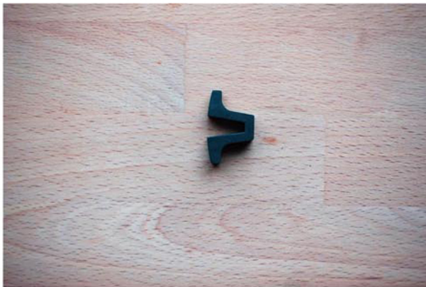
Z-axis Clamp Wedge. Quantity 2. Properties: Glass fiber reinforced polycarbonate.