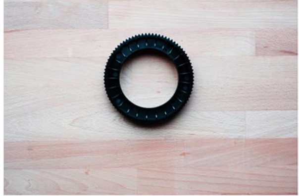
Belt Spool. Quantity 4. Properties: Polycarbonate.