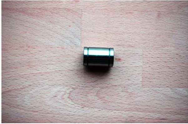
Linear Bearings. Quantity 4. Properties: Fits 10mm linear shaft.